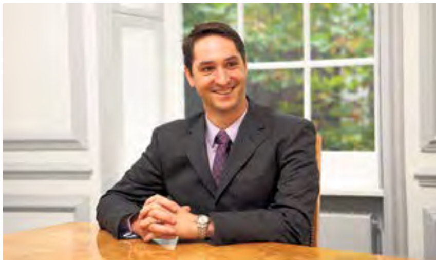
Newly appointed High Court Judge, Justice James Edelman