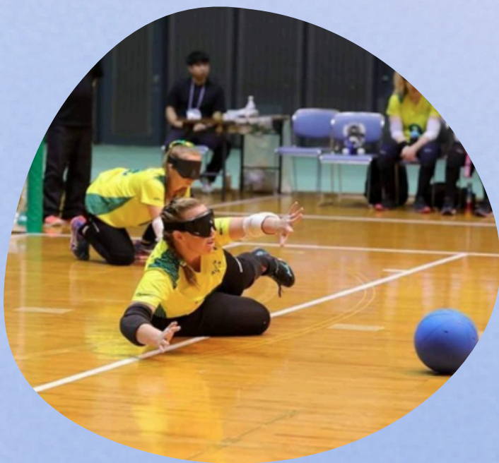
Goalball 11:00 - 12:00 Murdoch Active