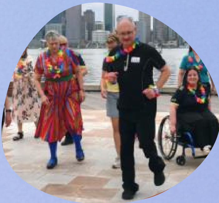
Dancing 1:00 - 2:00 The Den/Winter Garden