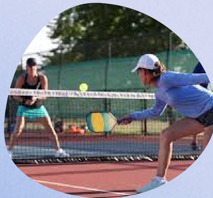
Pickleball 12:00 - 1:00 The Den/Winter Garden