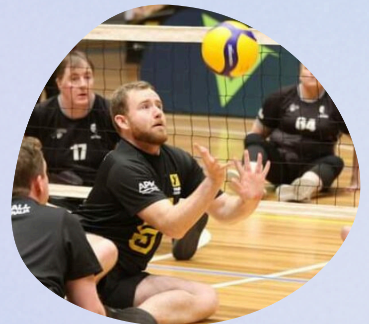
Sitting Volleyball 12:30 - 1:30 Bush Court