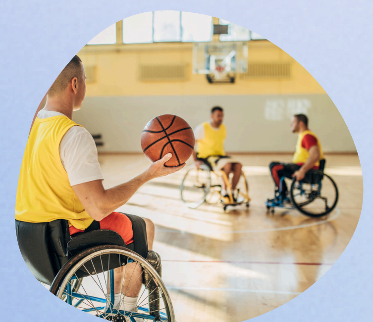
Wheelchair Basketball 3:00 - 4:00 Murdoch Active