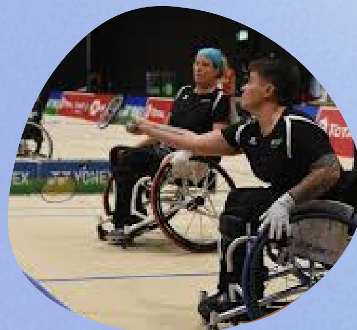
Wheelchair Badminton 2:00 - 3:00 Murdoch Active